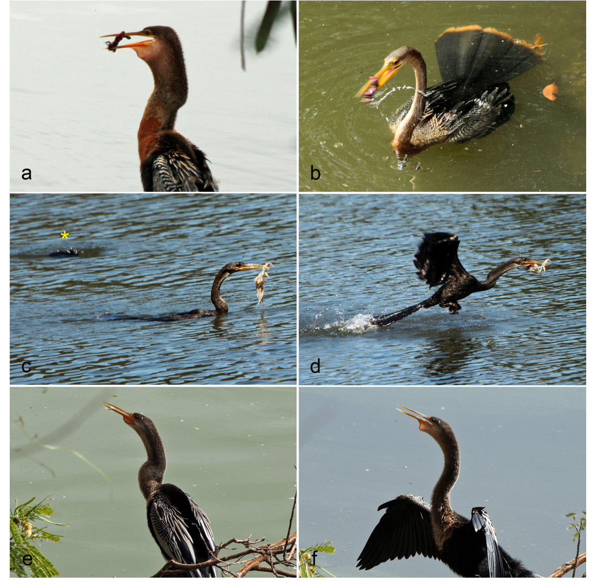
FIGURE 2. Anhingas ( Anhinga anhinga ) with anthropogenic debris stuck on bill and freed of it. An adult female with a cloth piece entangled on both mandibles tries to open the bill wide (a); the same individual just missed a stabbed fish prey that it was unable to hold and swallow (b); a juvenile male with a cotton waste stuck on bill pursued by a dominant female that dived (yellow asterisk on upper left) to surface next to the chased bird (c); the same male, with completely soaked plumage takes flight to evade the pursuer bird (d); an adult female with a natural mark (scar) behind the eye still carries a small piece of worn-out debris stuck on mandible (e) and free of the debris 10 days latter (f).

The birds managed to free most of the debris from bill in 17 out of 21 instances in 1-8 days after spending effort and time (several rounds up to 30 min), although small pieces or threads of worn-out debris remained stuck for 10-17 days. A male was able to free its bill from a large piece of woven plastic in 1 day (Figure 1 c). Another individual was recorded free of a small and worn-out debris piece after 10 days (Figures 2 e-f). From all debris