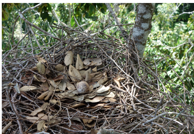
FIGURE 3. Nest 2 with one egg of Black-collared Hawk Busarellus nigricollis . The nest is neatly lined with leafy twigs. Photo taken on 29 June 2013.

Incubation period: When the camera was installed at nest 2 on 29 June, one egg was found in the nest (Figure 3). At night, the egg was incubated by the female only. In the morning, the female was relieved by the male between 06:51 h at the earliest and 11:24 h at the latest. Change-overs happened twice to four times a day, with the incubating adult flying off just before the arrival of the other adult. Thus the egg was never left alone for extended periods.