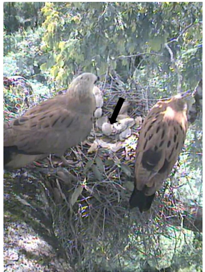
FIGURE 2. Pair of Black-collared Hawks Busarellus nigricollis on nest 2 with one egg (arrow). The female (left) is larger than the male (right), and has less and lighter black shaft streaks on the back. Photo taken on 6 July 2013.

Pre-breeding behavior: According to our observations in 2013, the pair of Black-collared Hawks of nest 2 first arrived in the area of the nest tree in March. The sex of the adults was distinguished by slight differences in color pattern and the size difference, the female being an estimated 20% larger and heavier, and having less and lighter black shaft streaks on the back than the male (Figure 2).