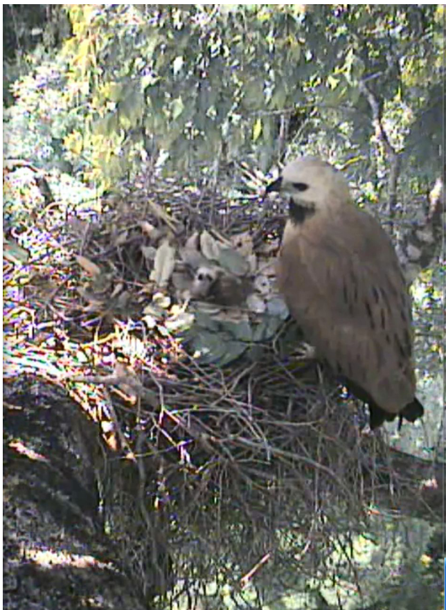
FIGURE 4. Female of Black-collared Hawk Busarellus nigricollis with nestling in nest 2 lined with leafy twigs. Photo taken on 12 July 2013.

During nine days of the incubation period, six fresh leafy boughs and one dead branch were recorded to be added to the nest, five by the female and two by the male. During 36 days of the nestling period, a total of 52 leafy boughs and dead branches were brought to the nest, 39 by the female and 13 by the male (Figure 3 & 4).