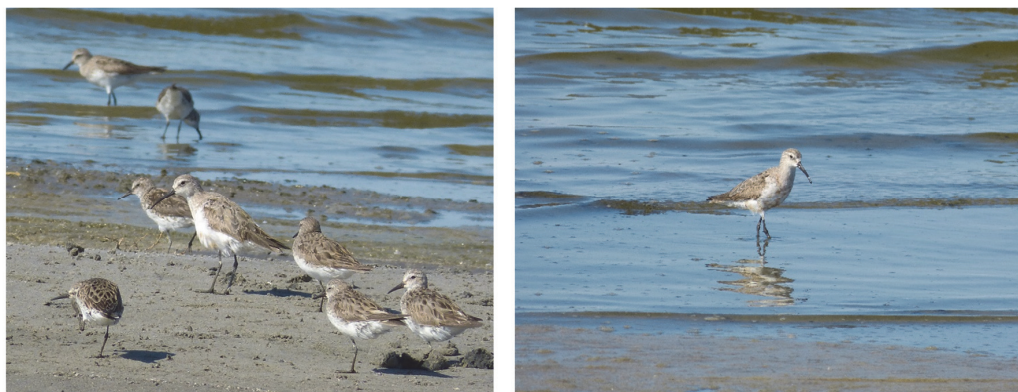
Figure 2. Curlew Sandpiper ( Calidris ferruginea ) recorded at Bahía de Mare (Río Primero mouth), in Mar Chiquita Lake, 17 October 2013. Note the curve bill, black legs and reddish feathers in the abdomen.

This record of Curlew Sandpiper adds a new species to Mar Chiquita Salt Lake and confirms its presence in Argentina. Additionally, some authors suggest that the records of Curlew Sandpiper in the Atlantic and Pacific coasts of South America might have been of vagrant or pseudo-vagrant individuals far from their regular south bound migration, along the Palearctic-Afrotropical Flyway and West-Pacific Flyway. Musher et al. (2016), for example, proposed that birds recorded at northeastern Brazil could have displaced from their migration routes through Europe to west Africa. These authors suggest that this hypothesis would be supported by the regularity of Curlew Sandpipers in Barbados, where a bird was recorded 14 days after had been banded in Belgium (Hayman et al. 1986). Contrary to what was proposed by Musher et al. (2016), we suspect that the individual reported here came from the Pacific coast, where this species is a regular visitor (considering the Andes would