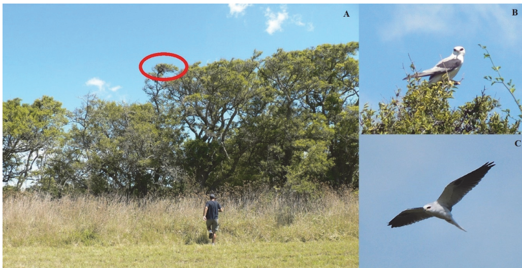
Figure 1. Location of one of the nests of White-tailed Kites ( Elanus leucurus ) in the upper part of a Tala ( Celtis ehrenbergiana ) in the edge of a Tala woodland (A). Male watching the territory perched near the nest (B) and hunting in a neighboring patch (C).

add new material (Saggese & de Lucca 2001, de la Peña 2016), which may be a strategy to save time and energy at the beginning of the season (Thiollay 2019). Thus, the nest building activity that we observe was likely related to nest "maintenance", a task that is performed almost exclusively by the female in most accipitrids, although the male may bring much of the material to her (Rettig 1978, Salvador-Jr. et al. 2008, de Lucca & Saggese 2012). In later stages of the breeding cycle, females stood guarding near or into the nest and males devoted most of their time to vigilance and prey provisioning (Fig. 2). These results indicate that incubation and direct feeding of chicks would be done almost totally by the female. On the other hand, we found that the prey provisioning was performed in total by the male, which is in agreement with previous reports for California (Watson 1940). This pattern of role partitioning between sexes, with the male being responsible for most of the hunting and the female