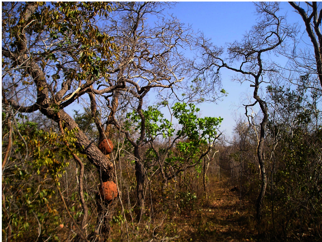
FIGURE 2. General aspect of the caatinga scrub found in Correntina, Bahia, with a strong influence of cerrado savanna. The net lane is in the background.