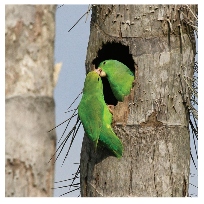
FIGURE 6. A pair of Green-rumped Parrotlets ( Forpus passerinus ) engaged in pre-nuptial feeding at the entrance of the nest hole after the nestlings of the Straight-billed Woodcreepers ( Dendroplex picus ) had flegded.