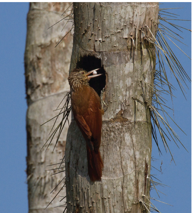
FIGURE 5. The Straight-billed Woodcreepers ( Dendroplex picus ) with a large, unidentified insect, and a lizard or hummingbird egg to feed the nestlings. Photo M. G. A.

therefore, poorly known. These periods are estimated to be, respectively, about 16 days and 18-20 days for similar sized woodcreepers of the genera Xiphorhynchus , Dendroplex and Lepidocolaptes (Marantz et al. 2003). After considering the size of food items brought to the nestlings on 6 September, we estimated they were then between 12 and 14 days old. With the above mentioned periods in mind, we calculated that the eggs were laid between 5 and 10 August. With incubation starting thereafter, the