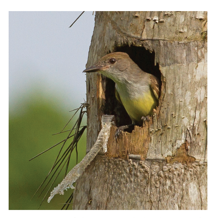
FIGURE 3. One of the Brown-crested Flycatchers ( Myiarchus tyrannulus ) with a piece of dry snake skin tries to occupy the nest hole of the woodcreepers.

Straight-billed Woodcreepers, as all woodcreepers, are chiefly insectivorous. They typically take small arthropods, but they also occasionally take small vertebrates, e.g. lizards. Eggs as food items for woodcreepers have until now only been mentioned for the White-throated Woodcreeper ( Xiphocolaptes albicollis ) which was observed to take bird eggs from cavity nests