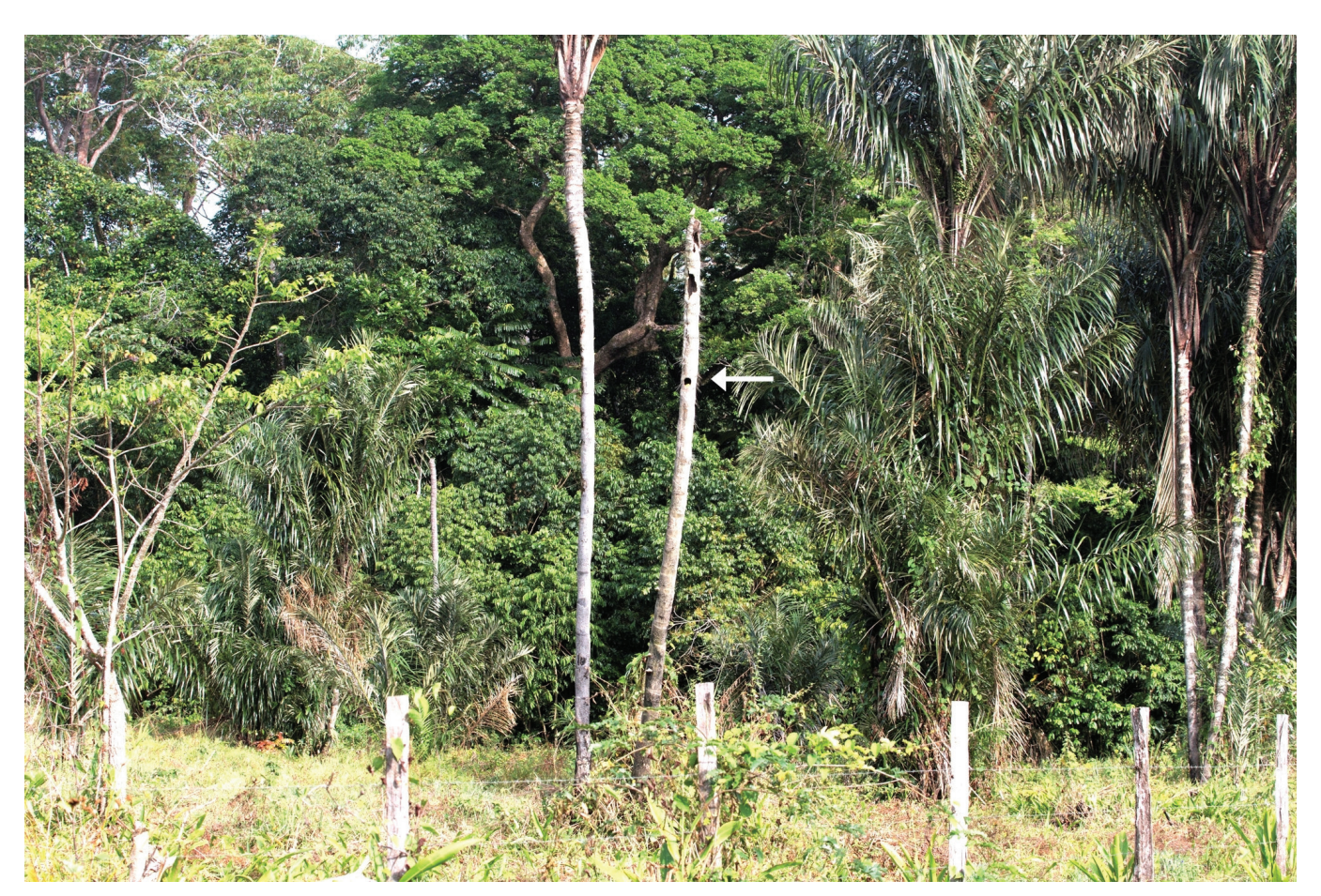
FIGURE 1. Site where the Straight-billed Woodcreepers ( Dendroplex picus ) nested. The dead awara palm ( Astrocaryum vulgare ), approximately 7.5 m high, is situated in the middle of the photo, right of a living one. The entrance of the old nest hole of the Spot-breasted Woodpeckers ( Colaptes punctigula ) used by the woodcreepers, is visible about 2 m below the top of the dead trunk (white arrow).

The diameter of the nest tree at the height of the nest hole and of the nest entrance, as well as the length of a strip of bark used in nest construction, were calculated in relation to the total length of 20 cm of a Straight-billed Woodcreeper (18-22 cm in Marantz et al. 2003).