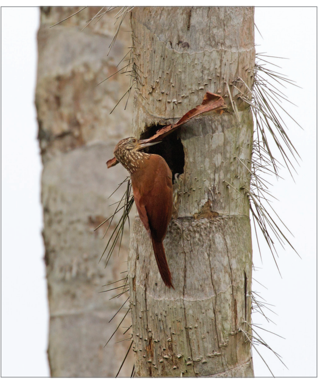
FIGURE 2. The Straight-billed Woodcreepers ( Dendroplex picus ) bringing a thin dry branch, and a strip of bark about 15 cm long, to partly fill the deep cavity of the old woodpeckers nest hole.

On 6 September, two adults were seen to bring food to the nest. One brought an unidentified arthropod and seconds later the other arrived with a small egg in its bill (Figure 5).