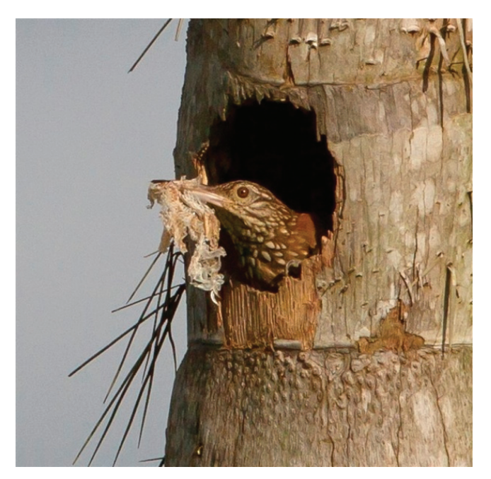
FIGURE 4. One of the Straight-billed Woodcreepers ( Dendroplex picus ) with a piece of dry snake skin in its bill, probably the one brought to the nest by the flycatchers. Later it took the skin back inside the nest hole to line the nest cavity.

Woodcreepers nest in natural cavities, which makes it difficult to closely follow the breeding cycle. The incubation and nestling periods of woodcreepers are,