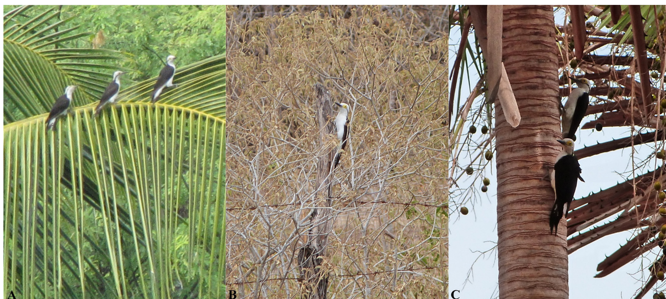
FIGURE 2. Photographic records of M. candidus . (A) Individuals sighted in the Parelhas city (record 1) and (B and C) individuals sighted in the Mossoró city (records 6 and 7).