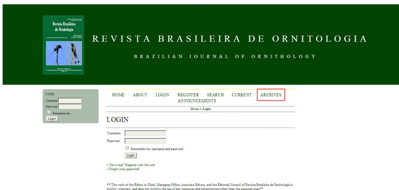
Figure 1 - Query volumes in the Archives.

To conduct a survey of all registered in RBO volumes, start the "Archives" menu;