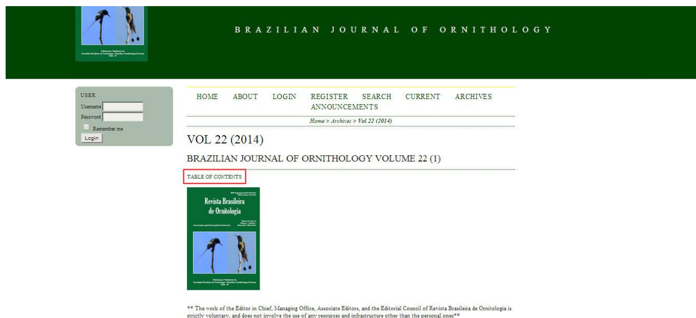
Figura 3 – Tabela de conteúdo.

Deve-se clicar no link “Table of Contents” para ter acesso aos conteúdos publicados desse volume.